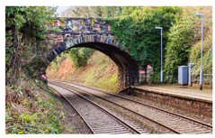
stone railway bridge