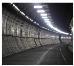
The Channel Tunnel is a tunnel under the sea that links England and France.

A tunnel is a long passage under the ground. Tunnels are usually built as a way of getting from one side of an obstacle to the other.