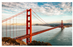
metal suspension bridge

A bridge is a structure built over a road, river or railway that allows people or vehicles to cross from one side to the other. Bridges can be built from a range of materials.