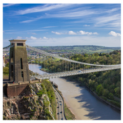
Clifton Suspension Bridge