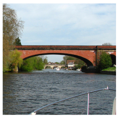
Maidenhead Railway Bridge