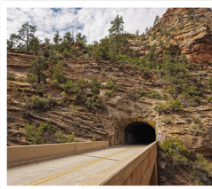
The Zion-Mount Carmel Tunnel in the USA is a tunnel through a mountain.