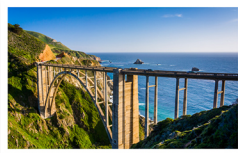
concrete road bridge