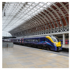
Great Western Railway