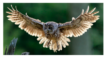
Blackbirds and tawny owls are birds.