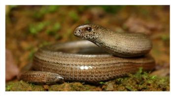
Grass snakes and slow worms are reptiles.