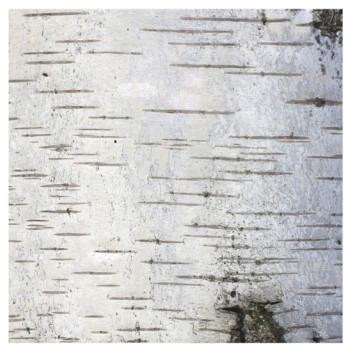
silver birch bark