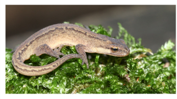
Common toads and smooth newts are amphibians.