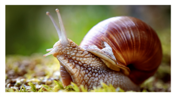
Ground beetles and garden snails are invertebrates.