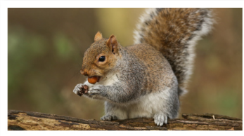
Red foxes and grey squirrels are mammals.