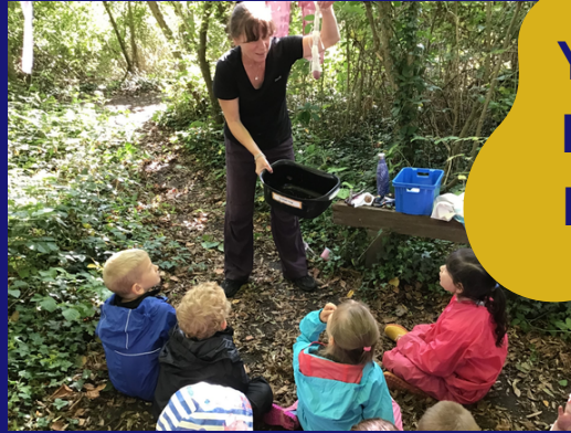
Year 1 Forest Friday

Year One have been having fun on Forest Fridays. This week the children learnt how to tie dye fabric using blackberries from the field on the school grounds.