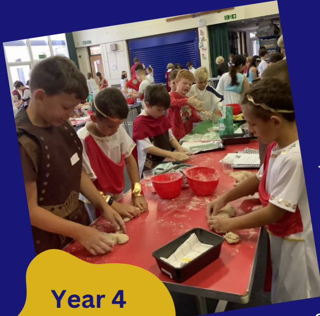
Year 4 Roman Day

Year 4 took part in an exciting Roman Day filled with fun and hands-on learning experiences for our children. The highlight of the day was undoubtedly the breadmaking activity. The whole year group got their hands dirty and created delicious Roman bread to taste at home. Our young historians had the opportunity to showcase their artistic skills by creating intricate Roman mosaics and built mini catapults whilst learning about the concepts behind the Roman army's success on the battlefield. Some of the catapults actually worked and launched mini projectiles across the classroom!