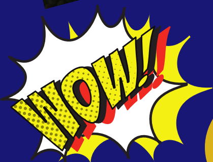
Crazy Science Worship with Duggie Dug Dug