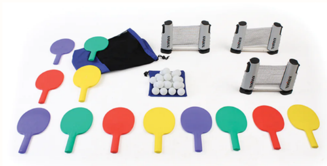
Table tennis tables and starter kits

A huge thank you to everyone who supported this event as £3000 is a fantastic amount of money for us to spend on sports equipment for the school. We wanted to let you know some of the items we have ordered and received this term: