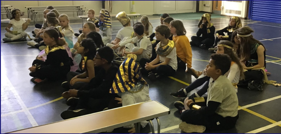
Year 5 Egyptian Day

Year 5 enjoyed an exciting topic launch, where they shared the day with the Theatre Company, learning all about life in Ancient Egypt. They became true Egyptians, bowing down to the pharaoh and using the River Nile in their daily life. Lots of fun and learning had by all!