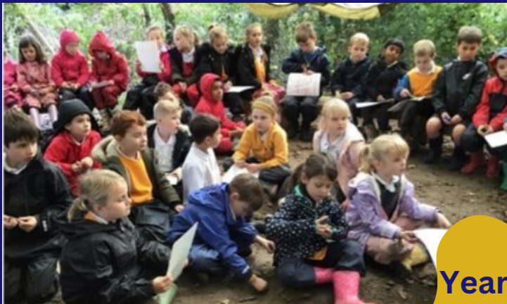
Year 2 Muck, Mess and Mixtures Day